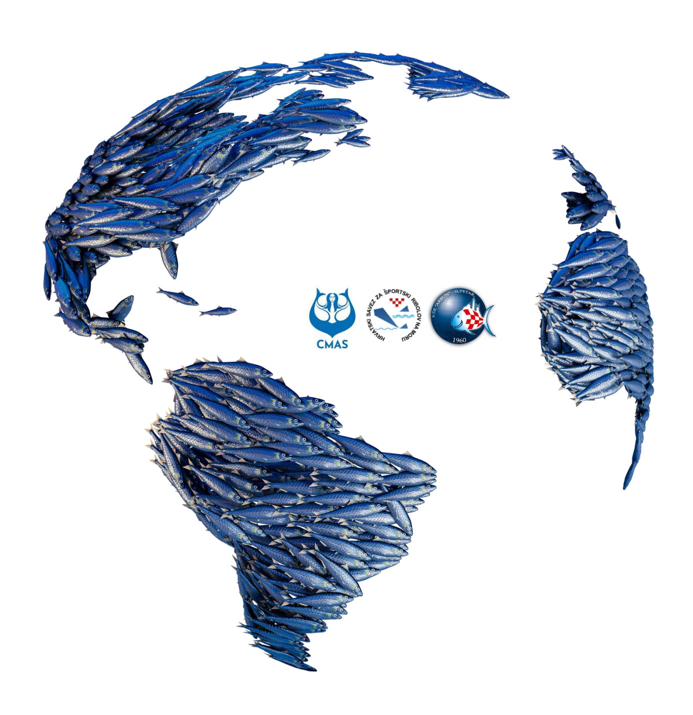
The 2nd CMAS WORLD SPEARFISHING CUP – CLUBS

SUPETAR, island of Brač, Croatia / May 3rd – 7th, 2023